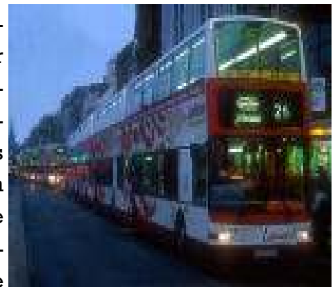
Lothian buses, one of the most modern fleets in the UK, wheelchairs users are still left at stops!

stop, Despite letter of complaint to Lothian buses no action seems to be forthcoming by the bus company. You should write to them if you have had any problems using the buses, please send the DDS a copy for our records.